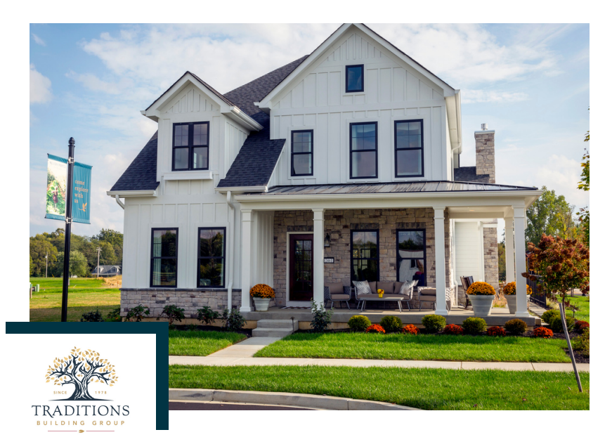
Homes by Gerbus, Inc.

Single Family Village Homes from $600s Courtyard Townhomes from $500s